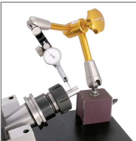
Indicator Arms are used to check concentricity on bench or machine. Dial Indicators not included.