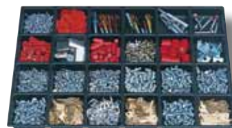
Parts not included